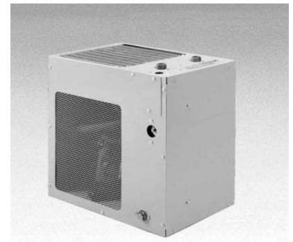
Model RLF12 Shown

Export Warranty: One year on component parts. Detailed warranty certificate enclosed with each chilling package, sample copy available upon request.